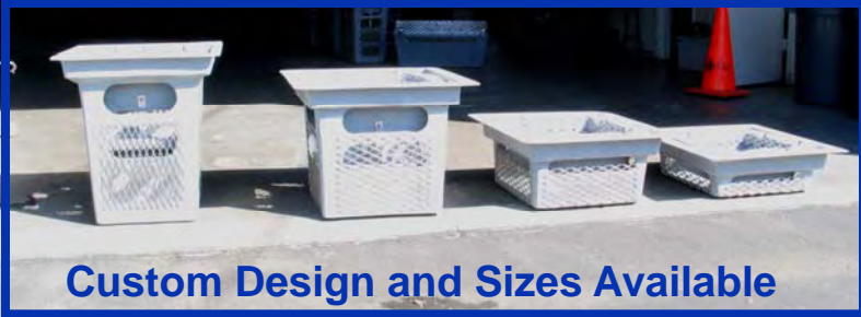
Custom Design and Sizes Available