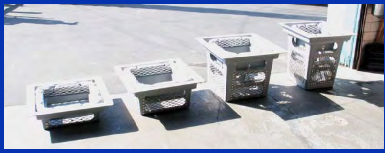
Offered in Many Sizes