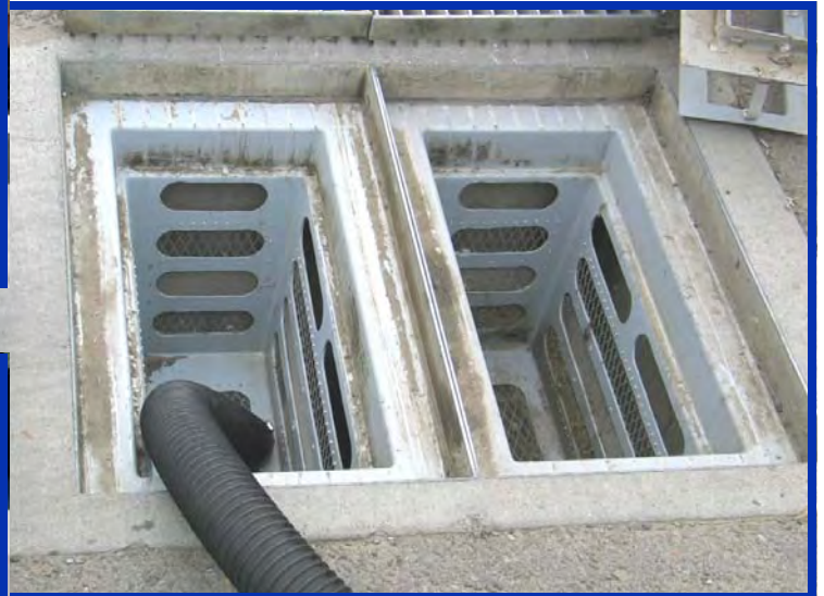
Designed for Easy Maintenance

Available with Additional Media Packs for Increased Removal Efficiency